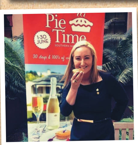
Launch of the Southern Highlands 'Pie Time' Destination Campaign