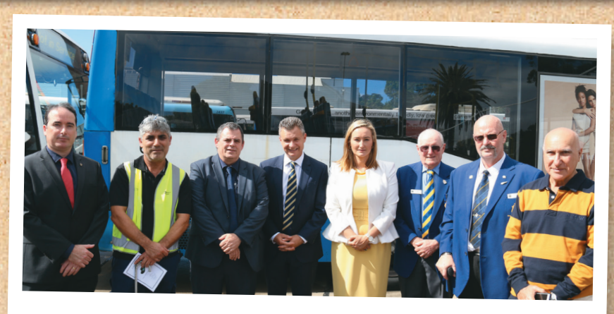
Randwick Bus Depot's 71st annual Anzac Day Service and Retired Member's Day