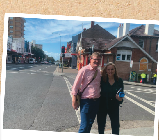
Talking to Local Business Owners