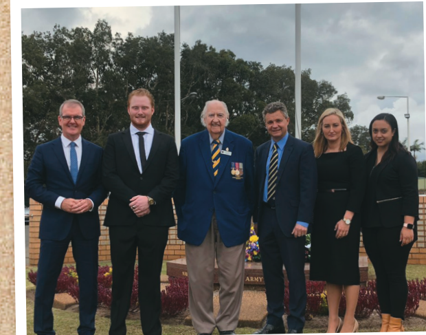
Battle of Long Tan Memorial Service